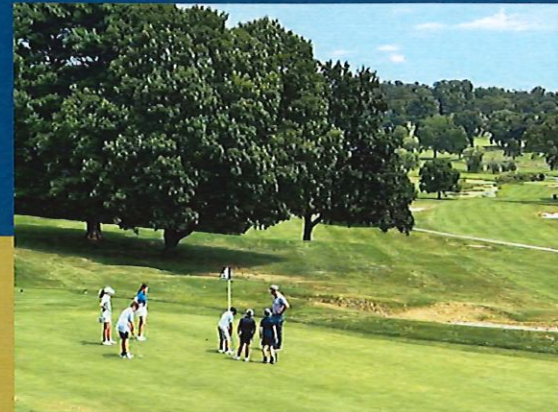
6 weeks of Junior Camp