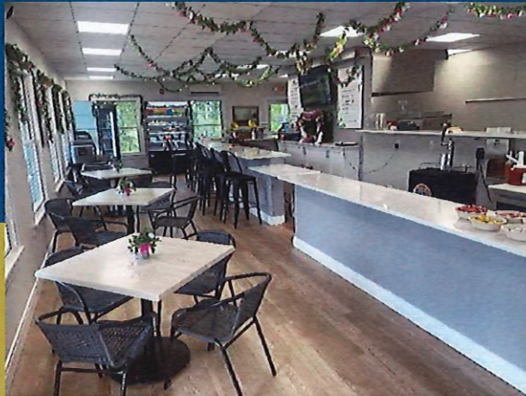
Interior of Cabana Grille Opening