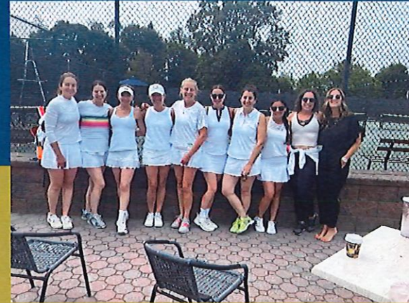
Champion Ladies Interclub Tennis Team